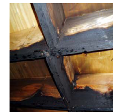
Fire Damage Before