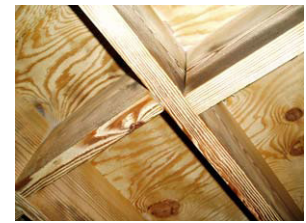
After Dry Ice Blasting